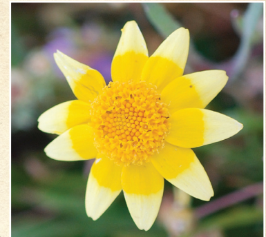
Bright yellow Goldfields

The dry phase begins with the hot summer weather. Any remaining water evaporates, the fairy and tadpole shrimp die, the flowers set seed, and the once-lush grasses turn golden brown during this six- to eight-month dry season, waiting for the winter rains to come again to repeat the cycle.