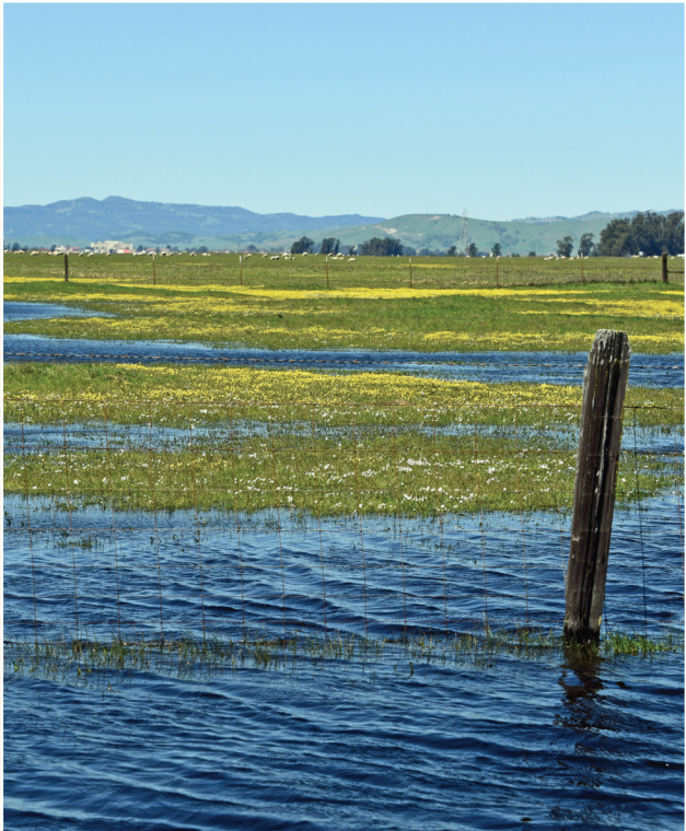
Islands of yellow carpet

Learn more about Jepson Prairie by taking a tour, or on our website: solanolandtrust.org