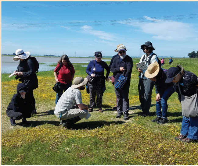
Enjoy a guided tour from mid-March through mid-May

Jepson Prairie Preserve is a jewel of California's environmental legacy. Every effort is made to manage the preserve with best management practices. Please support this standard of excellence by getting involved today.