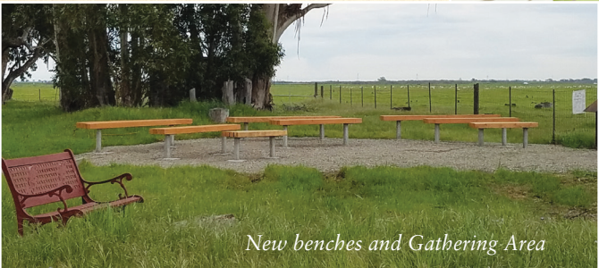
New benches and Gathering Area

Jepson Prairie Preserve is 12 miles south of Dixon, and eight miles north of Highway 12. From CA Highway 113 turn onto Cook Lane to reach the Visitor Area.