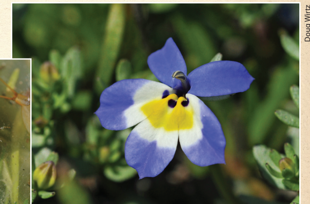
Downingia flowers add a splash of purple April – May