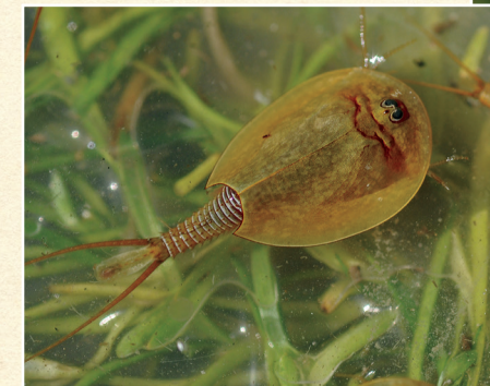
Vernal pool tadpole shrimp

Rare, vernal pool-specific invertebrates, including the Conservancy Fairy Shrimp and Vernal Pool Tadpole Shrimp, hatch and reproduce during this short wet phase . Specially certified Jepson Prairie Docents train to handle these rare organisms.